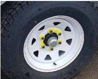
Wheel Nut Indicators