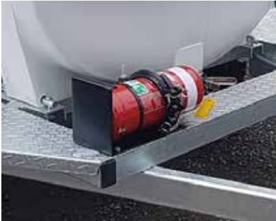
Fire Extinguisher - Quick release bracket