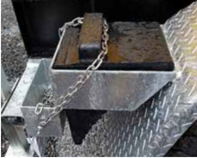
Wheel Chocks - Including holder