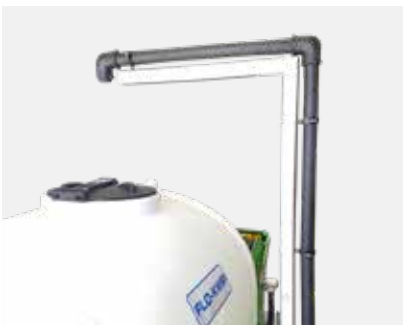
Standpipe Fill - Mounted on trailer - Camlock quick connection